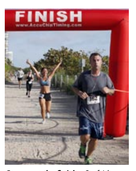
Strong at the finish - Surfside Mayor Daniel Dietch crosses the finish line with a kick.