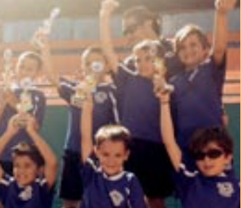
8 and Under