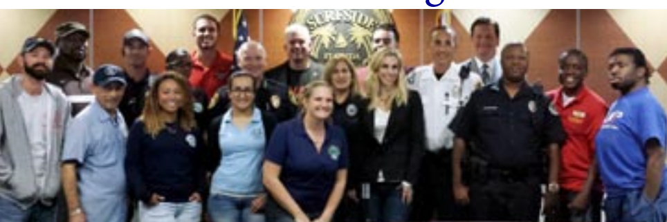
Participants in the My Life My Power mentoring training program.

Harbour and Bay Harbor Islands. Attendees became certified MLMP trainers and will use these skills to mentor children and teenagers in local schools and communities.