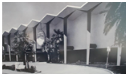
Surfside's first Community Center

On November 11, 1962, Surfside's Convention/Community Center was dedicated. This dedication was attended by various dignitaries but is most noted for the appearance of actress Jane Mansfield. The multipurpose rooms were then marketed by the Town for meetings and conventions to visitors while also