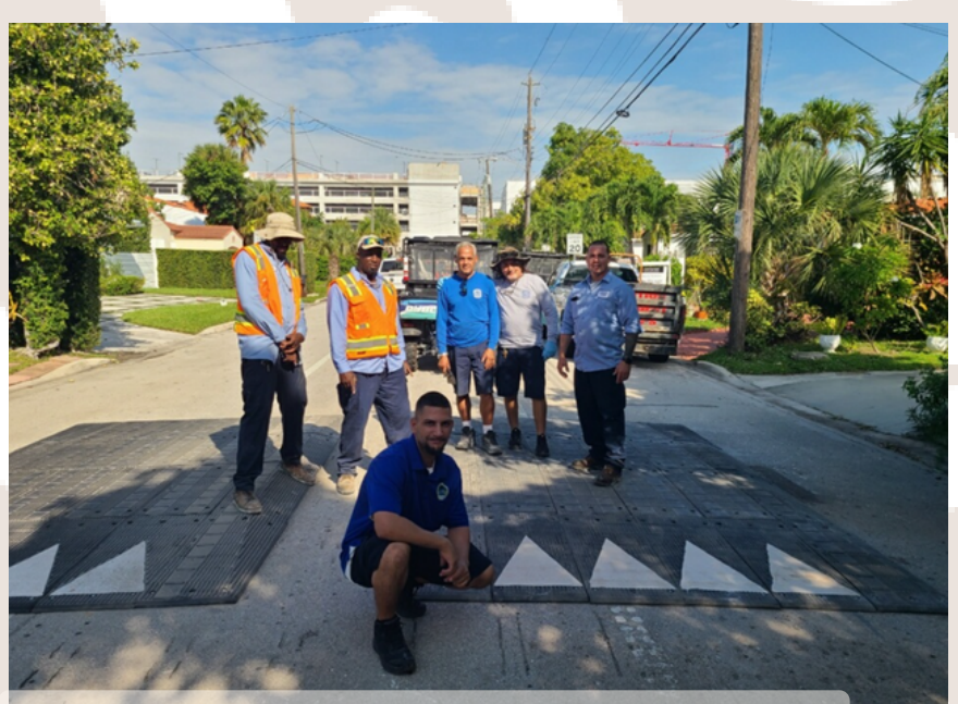
The Utilities Division and Maintenance Division worked together to install traffic-calming speed tables on Byron Ave.