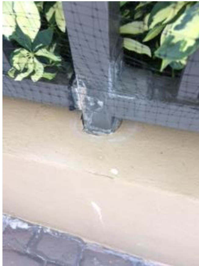
Figure 6: Water intrusion at rail posts