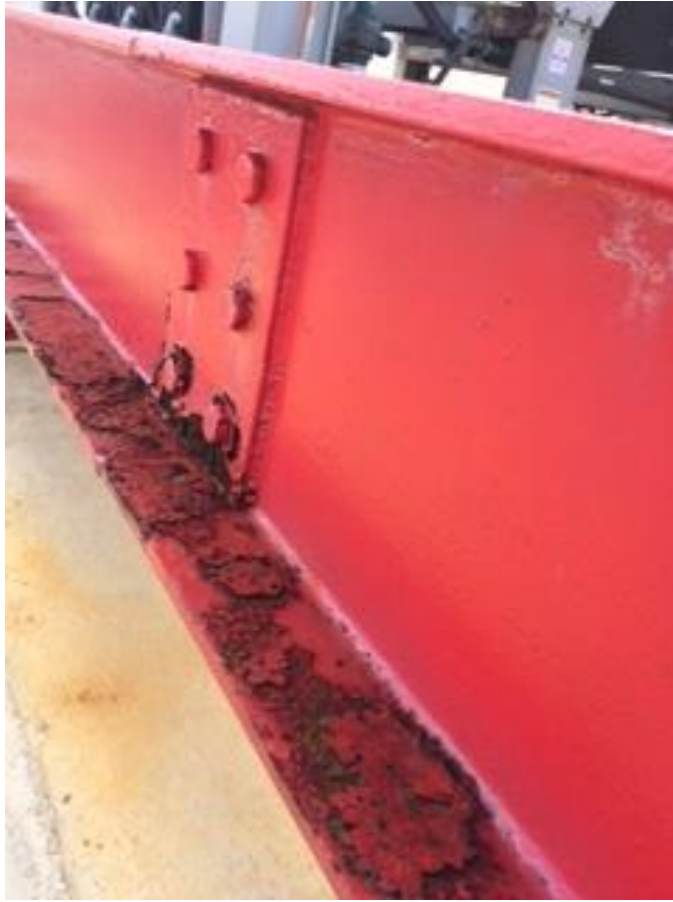
Figure 8: Rusted steel beam on roof 1