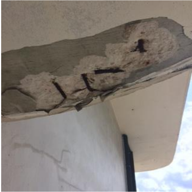
Figure 7: Balcony soffit deterioration