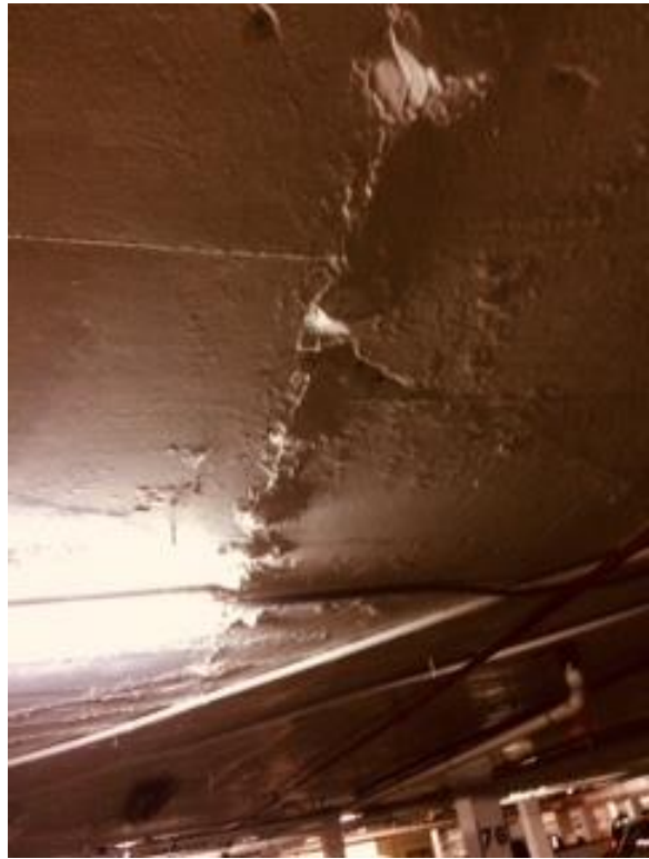
Figure 2: Hairline cracking at underside of floor slabs in garage