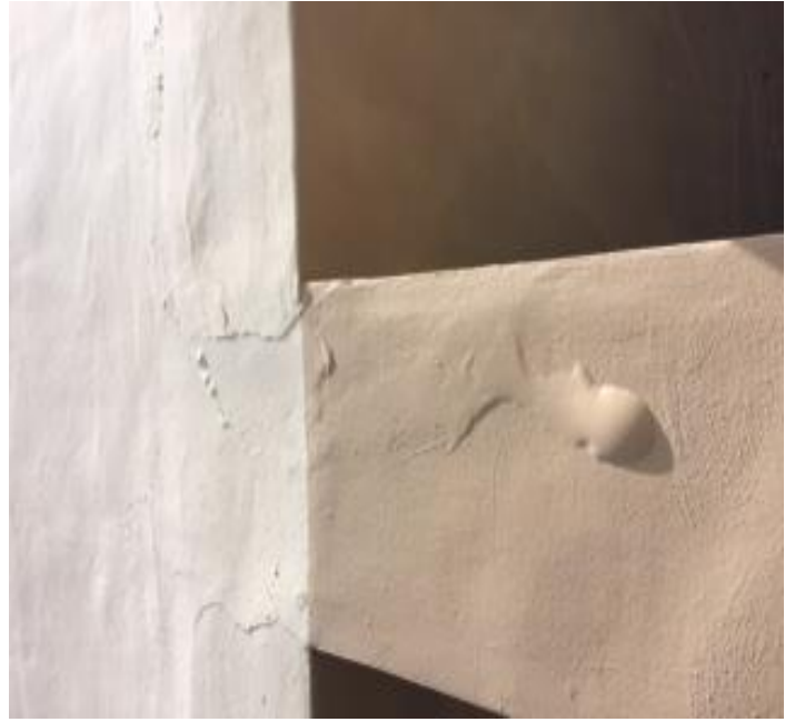
Figure 5: Delaminated stucco