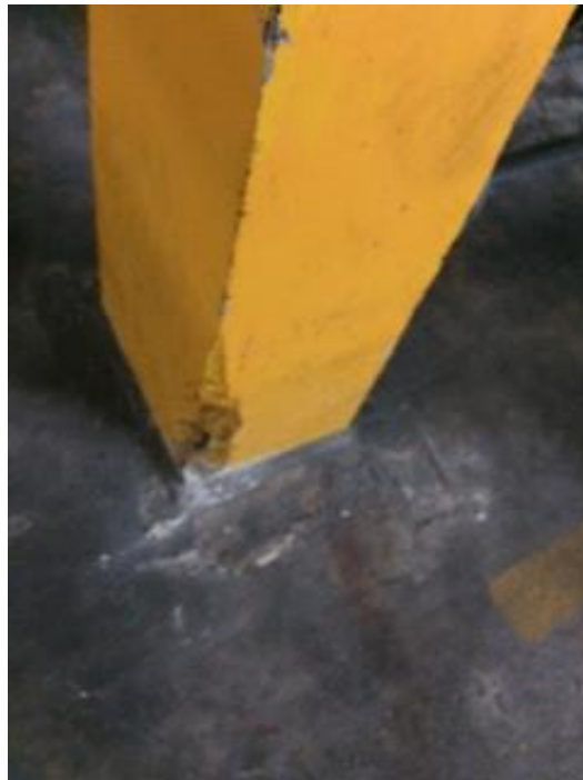
Figure 3: Column damage at ground floor