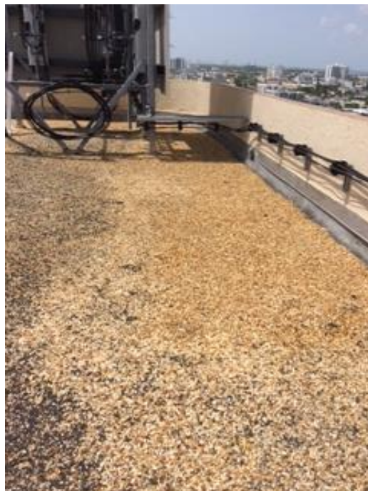
Figure 9: Repaired roof area