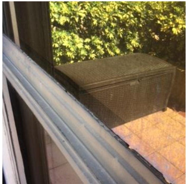
Figure 1: Cracking at balcony floor slab at sliding door threshold