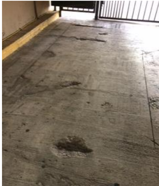
Figure 4: Delaminated concrete garage entrance