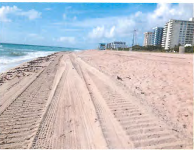
North view just south of the Community Center