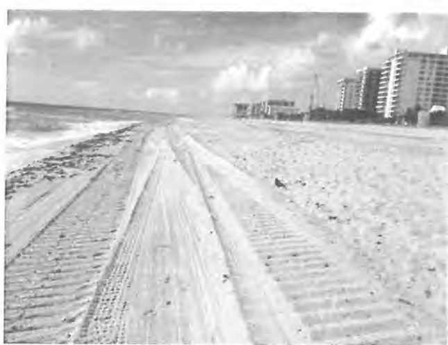
North view just south of the Community Center