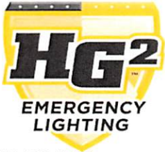
EXHIBIT "B" Quote

HG2 Emergency Lighting 477 N Semoran Blvd Orlando, FL 32807