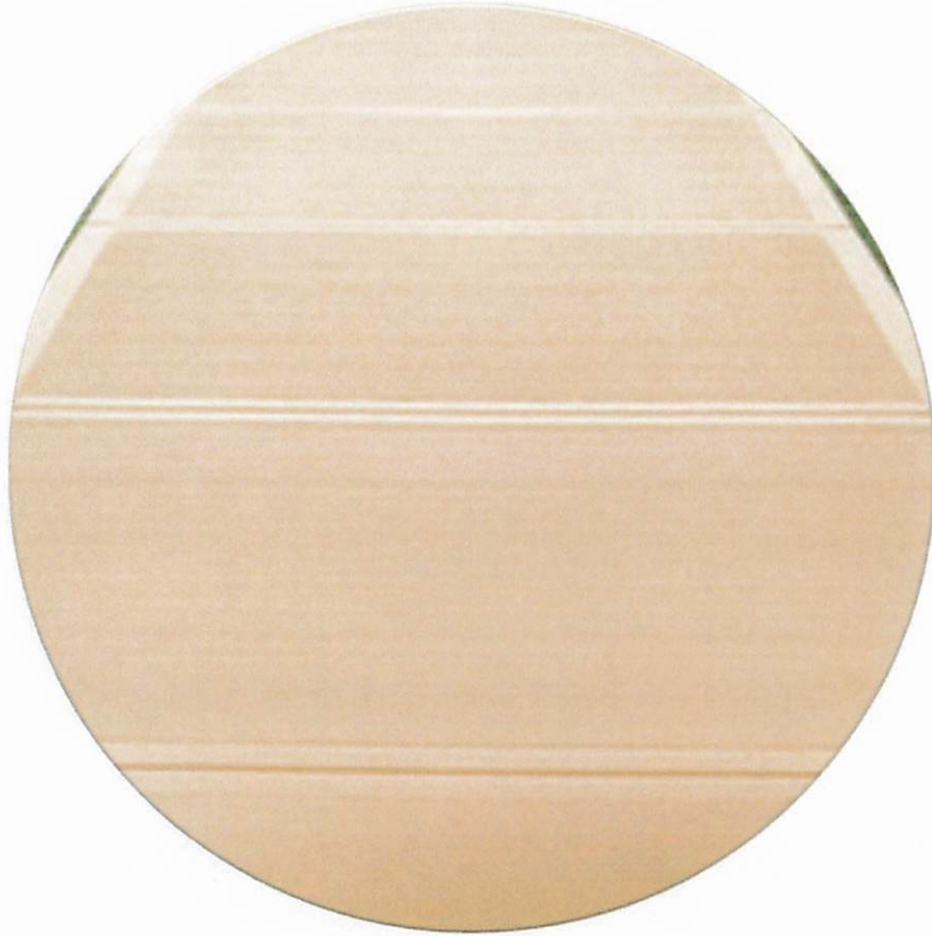
Broom finish with edge