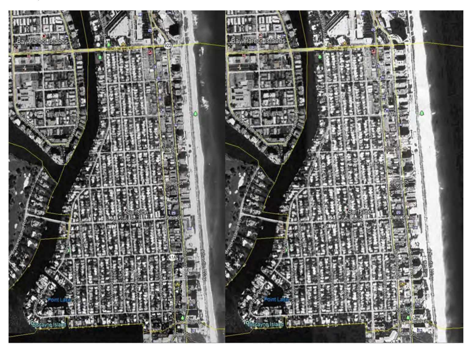
Aerial Photos of Surfside