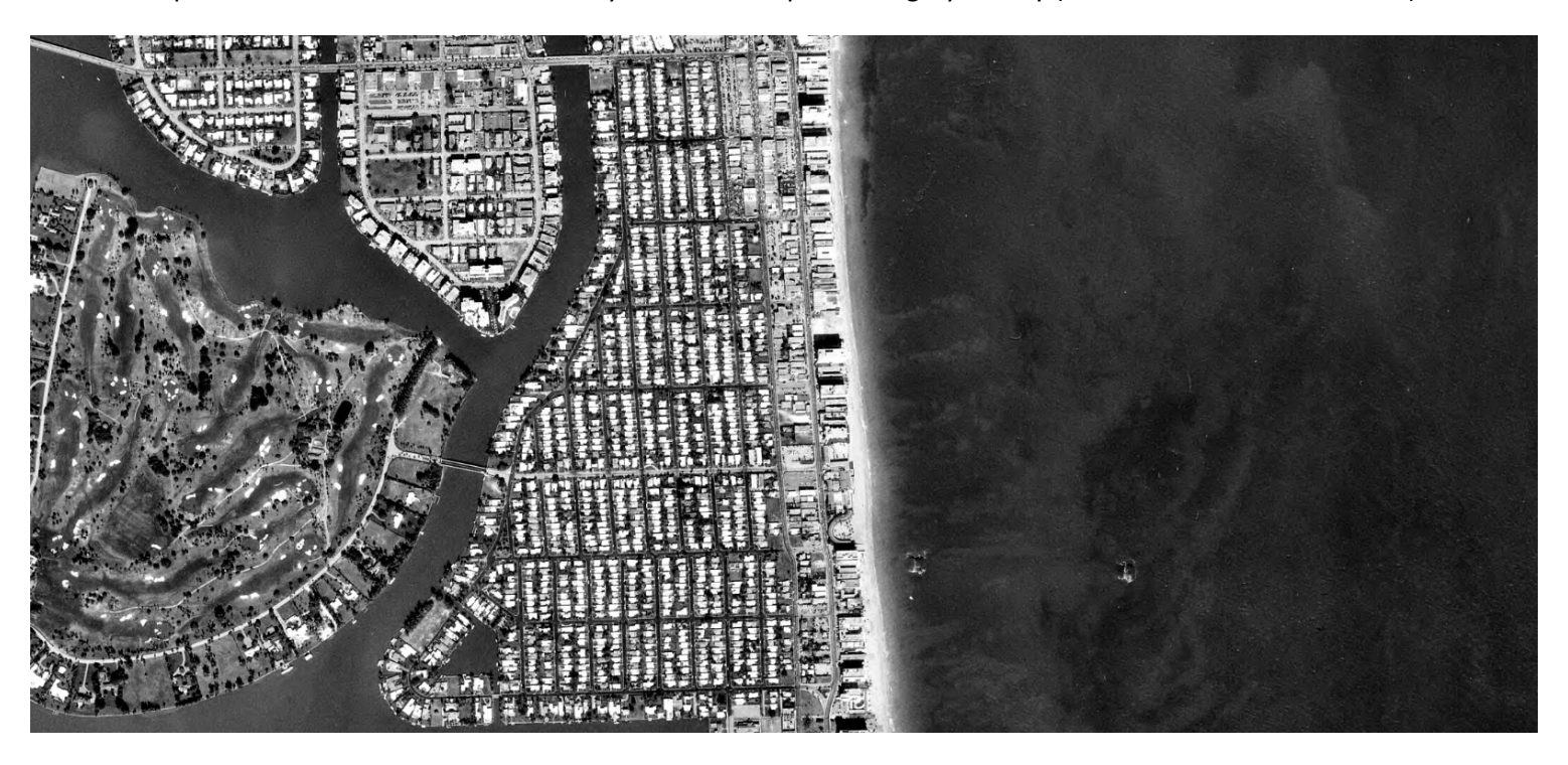
1984 Aerial Photo of Surfside from the University of Florida Map and Imagery Library (after beach renourishment)

1970 Aerial photo of Surfside from the University of Florida Map and Imagery Library (before beach renourishment)