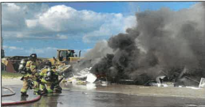
Firefighters extinguish a rubbish fire.

Miami-Dade Fire Rescue (MDFR) originated as a single-unit fire patrol in 1935. It has since grown into the largest fire-rescue department in the Southeast United States and one of the top ten largest in the nation. MDFR serves a response territory of 1,904 square miles and a resident population of more than 1.9 million. MDFR responds to more than 280,000 calls for assistance annually, making it one of the busiest departments in the nation. More than 2,800 employees staff 160 units in service throughout 71 fire-rescue stations and several administrative facilities serving residents, businesses, and visitors 24 hours a day, 7 days a week, 365 days a year. In addition to providing transport services through 64 advanced life support (ALS) rescue units, MDFR provides emergency air transport service to appropriate specialized facilities via two full-time rescue helicopters.