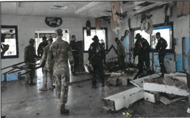
MDFR's FL-TF1 assists with rescue efforts following Hurricane Idalia

In early August 2023, MDFR's Florida Task Force 1 (FL-TF1) received Activation Orders from the Federal Emergency Management Agency (FEMA) to deploy a canine search team to assist in response efforts to Maui, Hawaii in the aftermath of the wildfires. The team was tasked with searching disaster environments and locations for possible survivors. Later that same month, a 90-member team was deployed to Orlando, FL to assist in response efforts ahead of Hurricane Idalia. Throughout their deployment, FL-TF1 conducted damage assessments throughout the affected areas in the Big Bend region. Additionally, the team worked alongside local and state agencies to provide aid to the residents in these communities.