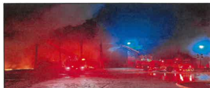
MDR crews battle fire at Covanta Energy Plant in Doral, FL

On February 12, 2023, MDR responded to a fire at the Covanta waste-to-energy plant in Doral, Florida. Upon arrival, crews encountered extreme fire conditions from a deep-seated trash fire in one of the storage buildings. Ultimately, this fire escalated to a fourth alarm requiring over 200 firefighters and over 70 units to halt the fire's progression. Due to the severity of the blaze and the challenges involved with combating it, the incident spanned multiple weeks as the fire remained burning beneath the rubble with limited access.