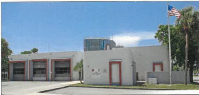
Haulover Fire-Rescue Station 21 serving the Town of Surfside