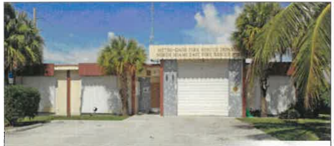
North Miami East Fire-Rescue Station 20 serving the Town of Surfside

MDFR has 64 frontline rescue units, each staffed by three (3) State of Florida certified paramedics. MDFR offers patient transportation options. Patients with life-threatening emergencies will be transported to the closest appropriate medical facility within Miami-Dade or Broward County. MDFR will transport patients without life-threatening emergencies to the medical facility of their choice. MDFR also has EMS Captains who act as patient advocates in ensuring the timely transfer of patients to Miami-Dade and Broward County medical facilities.