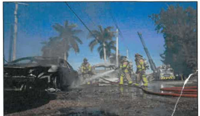
Firefighters battle multiple vehicle fires at a business in Medley.

Through the efforts of MDFR, Miami-Dade residents also have the highest survival rates in the nation after suffering a blocked coronary artery. Over 15 years ago, MDFR established the Miami-Dade STEMI (ST-Elevation Myocardial Infarction) Network. STEMI typically refers to a blocked coronary artery and is the leading cause of death in the United States. Hospitals within the network are required to restore blood flow to a patient's blocked artery within 90 minutes from the initial patient contact. This timely intervention significantly reduces a patient's chances for permanent damage or death and increases the likelihood for survival. The STEMI network has reduced the time it takes to restore blood flow to a patient from approximately two hours and 15 minutes to 60 minutes. MDFR is also part of the Countywide Stroke Network, a coalition consisting of MDFR along with five municipal fire-rescue departments and area hospitals within Miami-Dade County. This network is one of the largest for the treatment and transport of stroke victims in the nation.