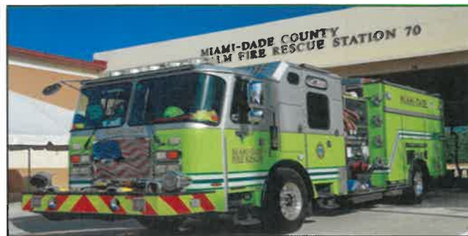
Engine 70 placed in service at Coconut Palm Fire-Rescue Station 70.

On September 11, 2023, MDR placed two new units in service. Rescue 61 operates out of Trail Fire-Rescue Station 61, located at 15155 SW 10th Street. This unit will reduce response times and enhance emergency medical services to western areas of unincorporated Miami-Dade County.