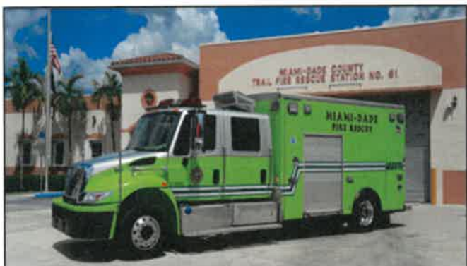
Rescue 61 placed in service at Trail Fire-Rescue Station 61.

ALS Hazardous Materials (HazMat) Engine 70 was placed in service at Coconut Palm Fire-Rescue Station 70, located at 11451 SW 248th Street. This unit will enhance fire suppression and hazardous materials response coverage within southern portions of the County.