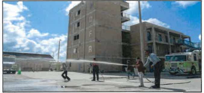
MDFR hosts educational event at Headquarters.

MDFR personnel are individually committed and collectively exemplify our mission: Always Ready, Proud to Serve . Fulfilling our mission goes beyond the life-saving services delivered every day – it also includes providing essential fire and life safety education to the community offered by dedicated public education personnel and first responders within their respective service territories. Community education includes station open houses, truck demonstrations, and presentations to senior citizens and children, as well as local businesses, schools and non-profit organizations, with the goal of preventing medical and fire emergencies from occurring in the first place. In 2023, MDFR provided 50 Surfside residents with life-saving education and resources.