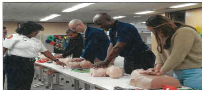
MDR leads a HELP class.

During 2023, MDR also launched the Health Emergency Life Program (HELP), an interactive, hands-on training that teaches lifesaving actions residents can take until first responders arrive. Through this community-based program, Miami-Dade County employees and residents learn adult and pediatric hands-only CPR, automated external defibrillator (AED) operation, early stroke recognition, stop the bleed methods, and blocked airway emergency assistance for adults, children, and infants.