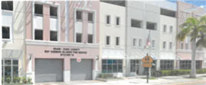
Bay Harbor Fire-Rescue Station 76 serving the Town of Surfside

Daily there are 58 firefighters on duty, 38 which are certified paramedics assigned to these units. This exceeds the National Fire Protection Association (NFPA) recommended guideline for responding to both high and medium occupancies.