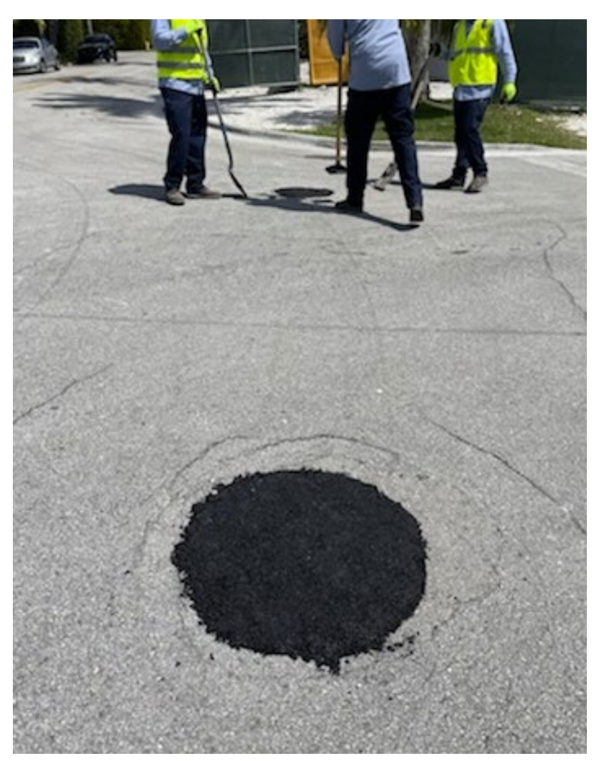
Patched potholes throughout Town