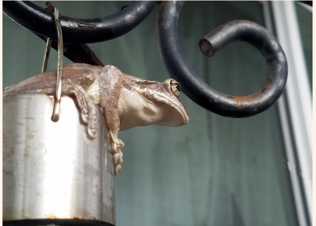
GRAND PRIZE • JACK OMALLEY $100 Parks and Recreation Gift Certificate