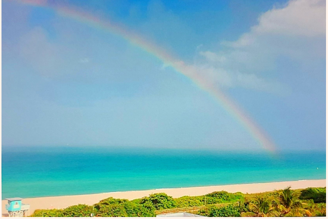
FIRST PRIZE • JIM BENEZRA $75 Parks and Recreation Gift Certificate

Thanks to all of the talented residents who joined in the 2021 Earth Day photo contest. The theme of nature and landscape brought many beautiful and memorable images for the contest. Start planning for 2022!