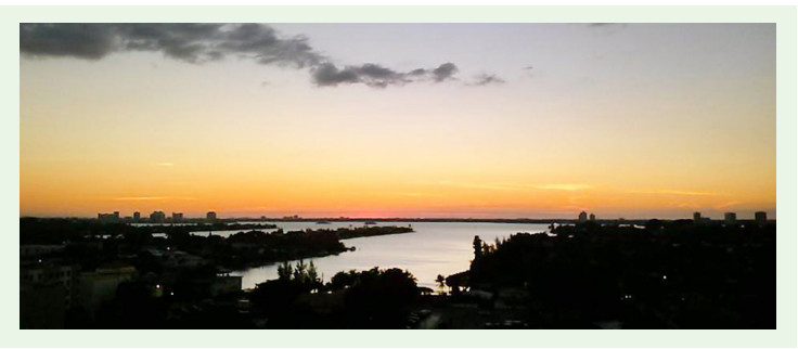
November 2, 2014 from the Champlain Tower South, looking west.