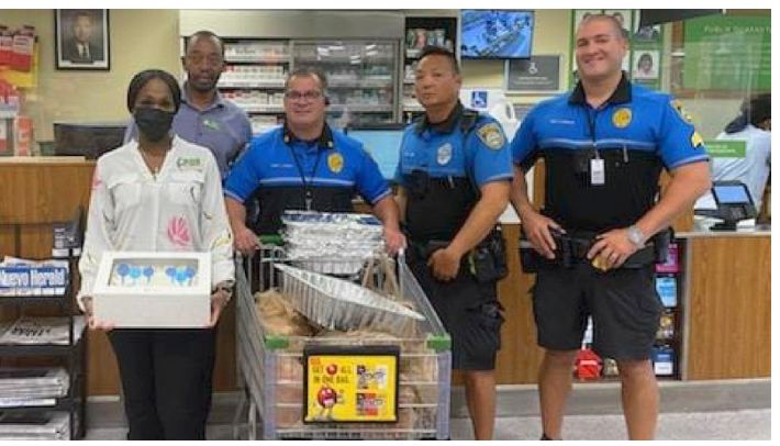
Surfside Publix provides a lunch on a Sunday to the Police Department. Publix graciously offered hundreds of meals for employees during the weeks after the collapse.