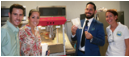
Residence Inn Miami Beach Surfside

Also visited was Bluegreen Vacations Solara Surfside