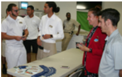
Grand Beach Hotel Surfside