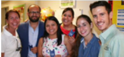
Four Seasons Hotel at The Surf Club